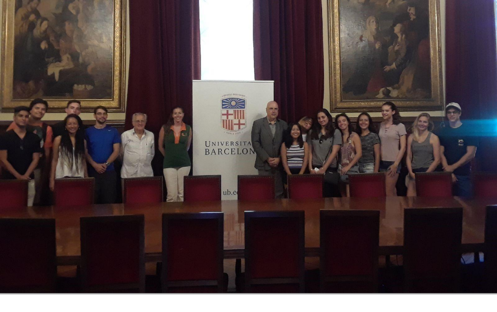
University of Barcelona