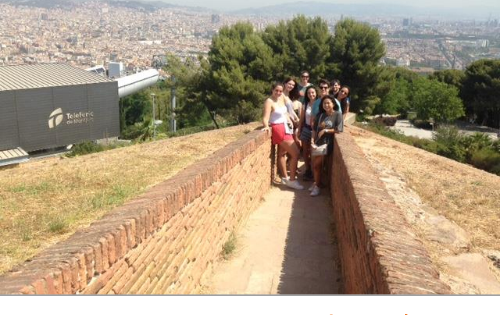
Montjuic Mountain & Castle