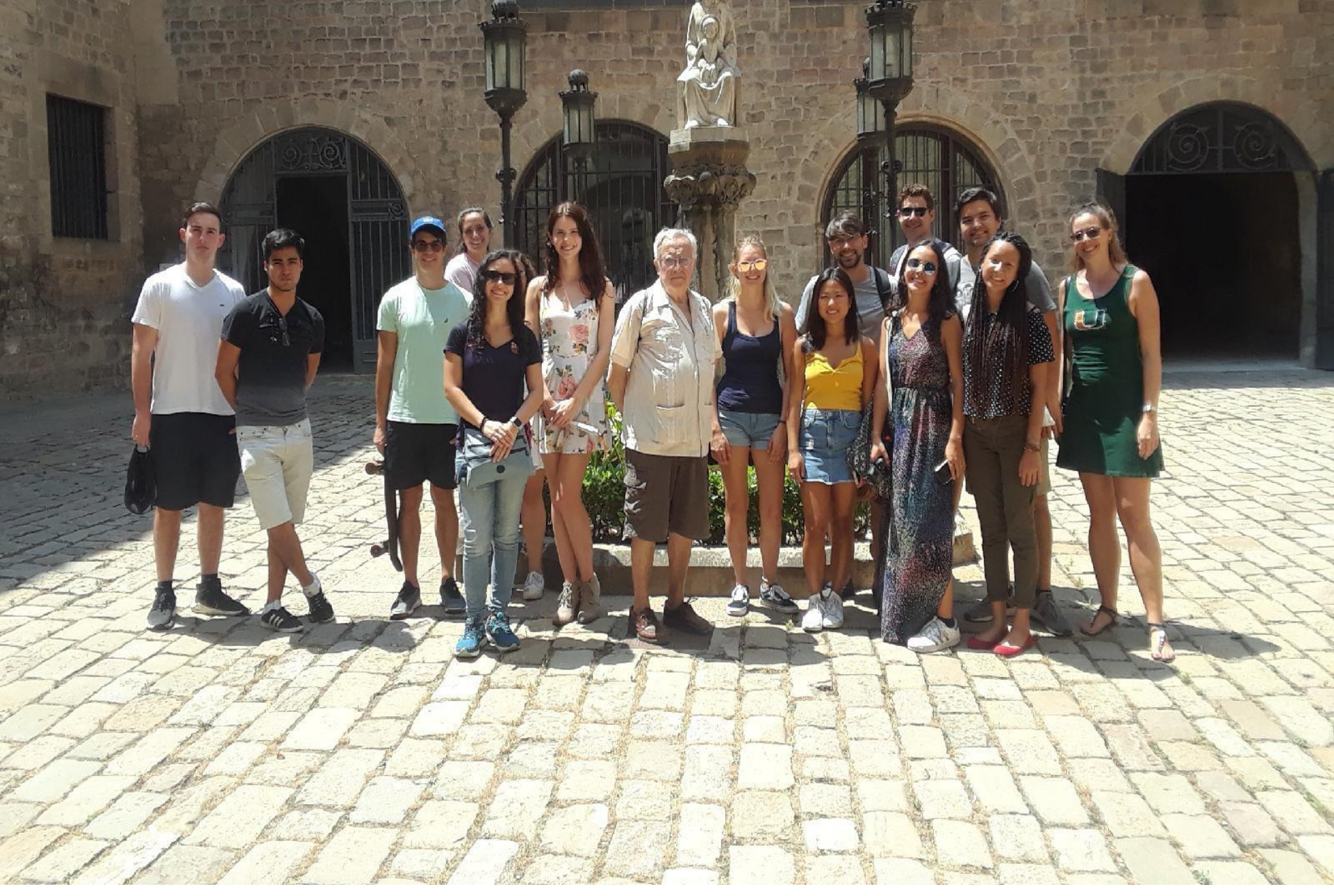
Historic Medieval Barcelona