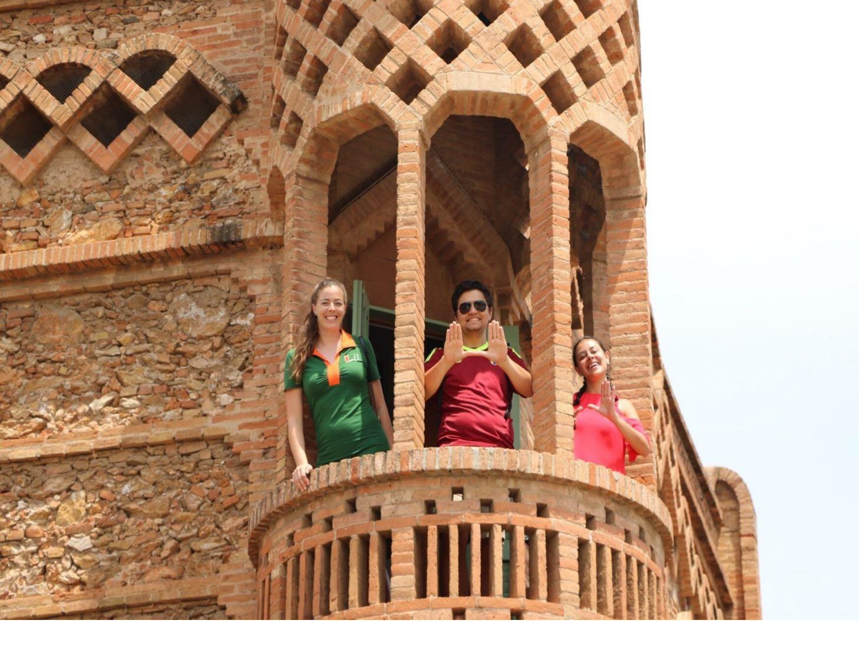
Colonia Güell Village & Gaudi Crypt World Heritage Site