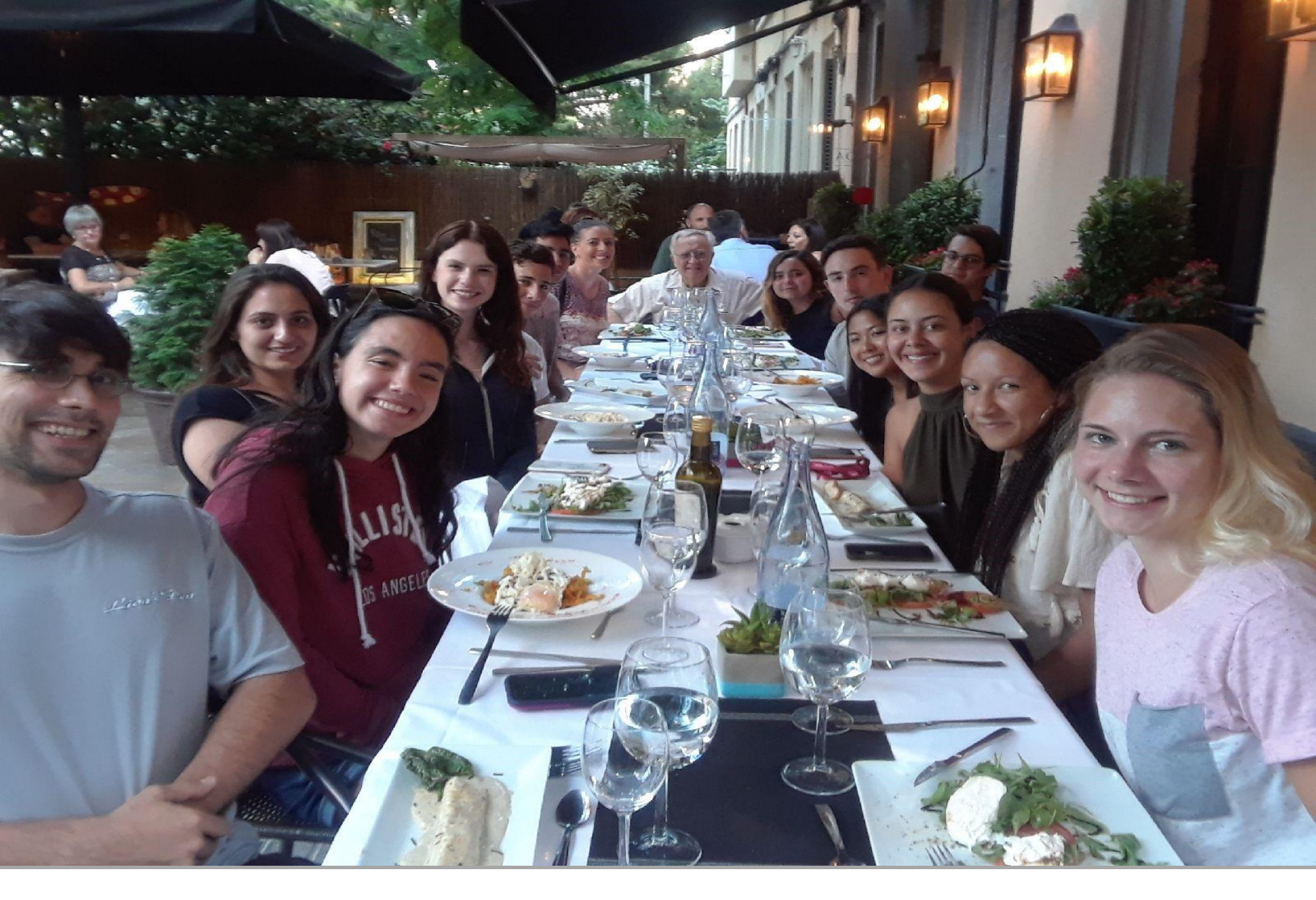
Welcome Dinner in Barcelona