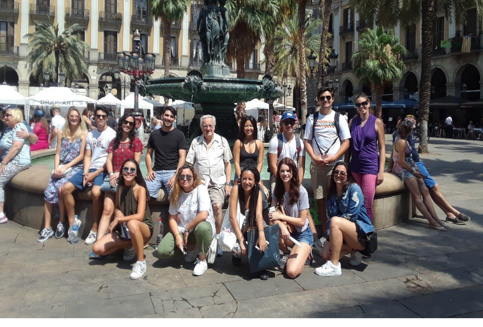
Plaza del Rey