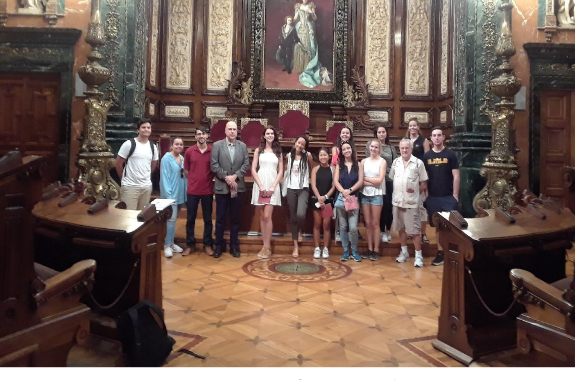
University of Barcelona