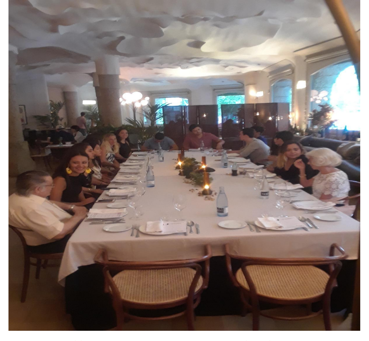
Farewell Dinner Casa Mila by Gaudi sponsored by the Gaudi Research Institute