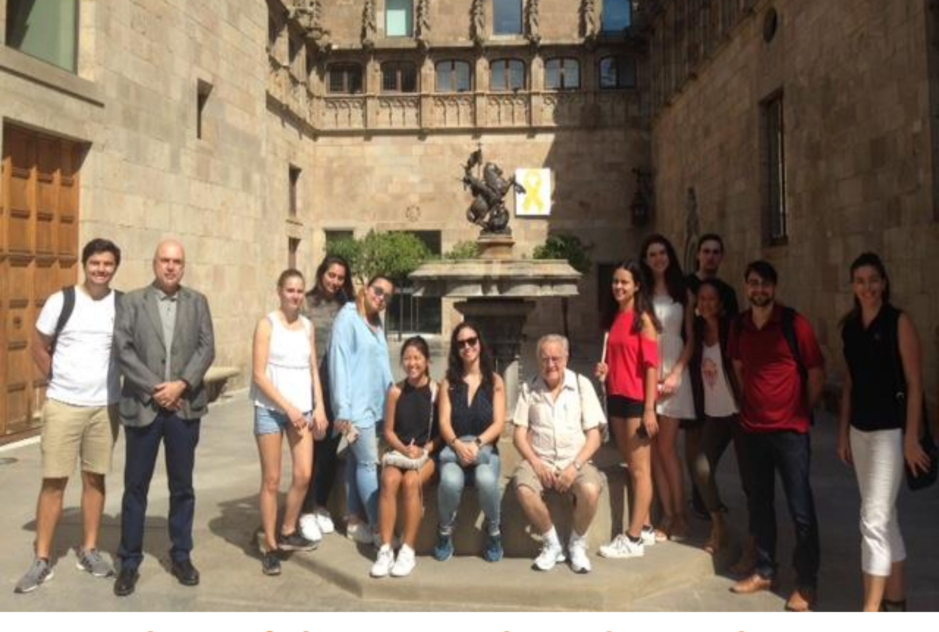
Palace of the Generalitat de Catalunya