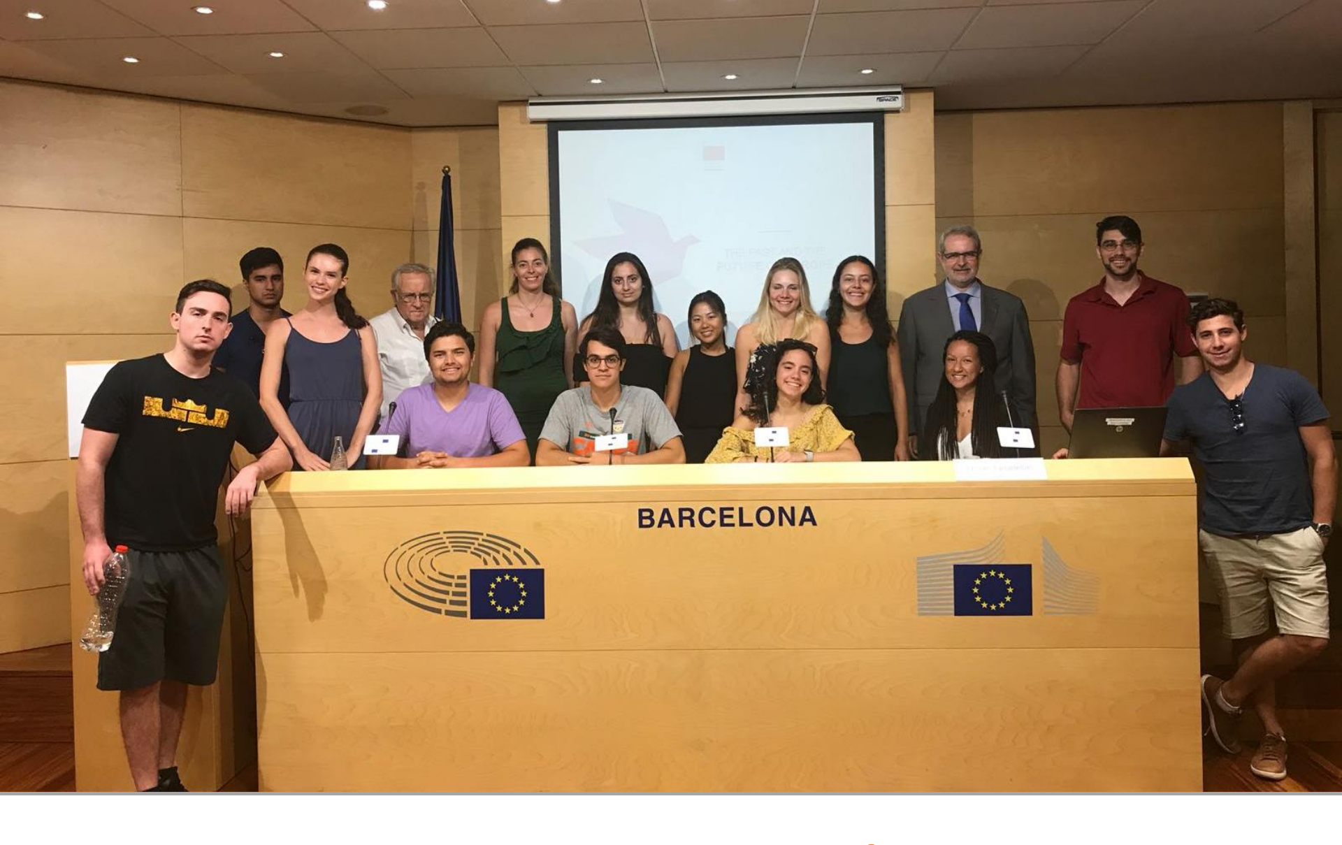
European Union Delegation